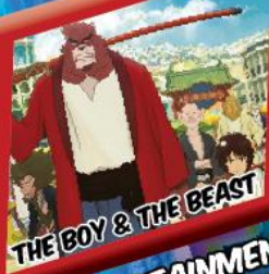
THE BOY & THE BEAST