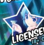
LICENSED BAR 18+ ONLY

BOOK FILM TICKETS ONLINE OR $10 AT THE DOOR