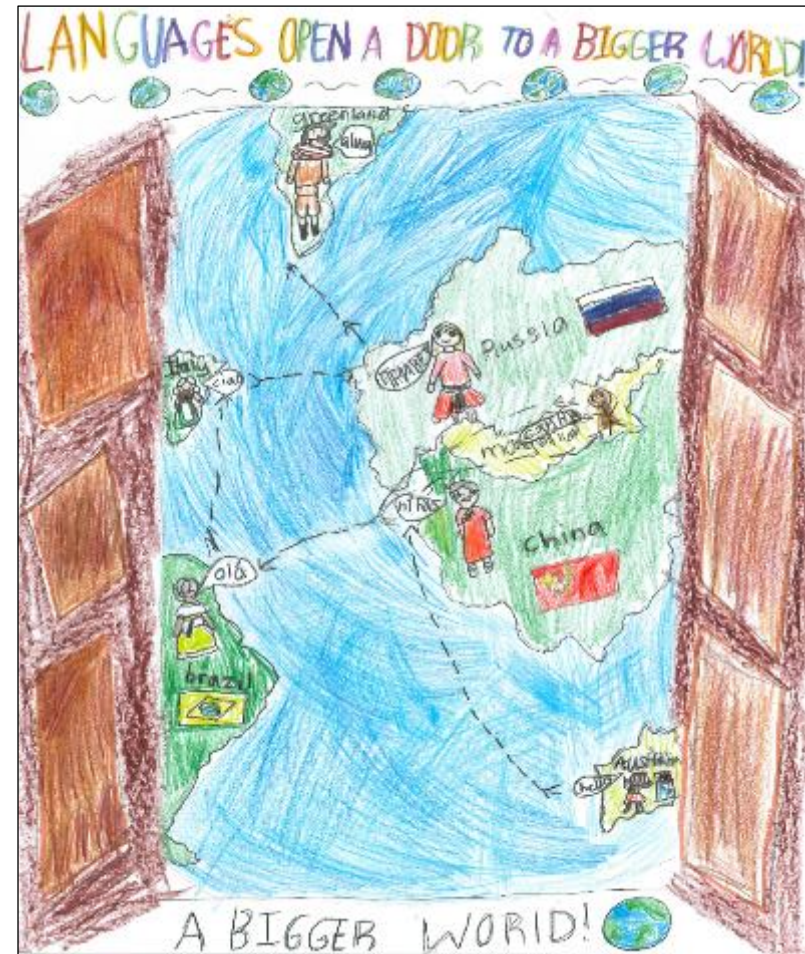
Zoe Schwarz, Year 3 Chinese