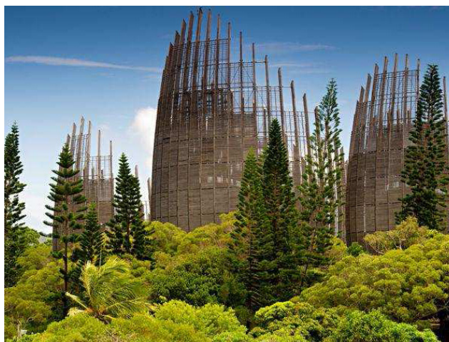
Tjibaou Cultural Centre, Noumea.

All flights, internal transport, accommodation, breakfasts and dinners included.