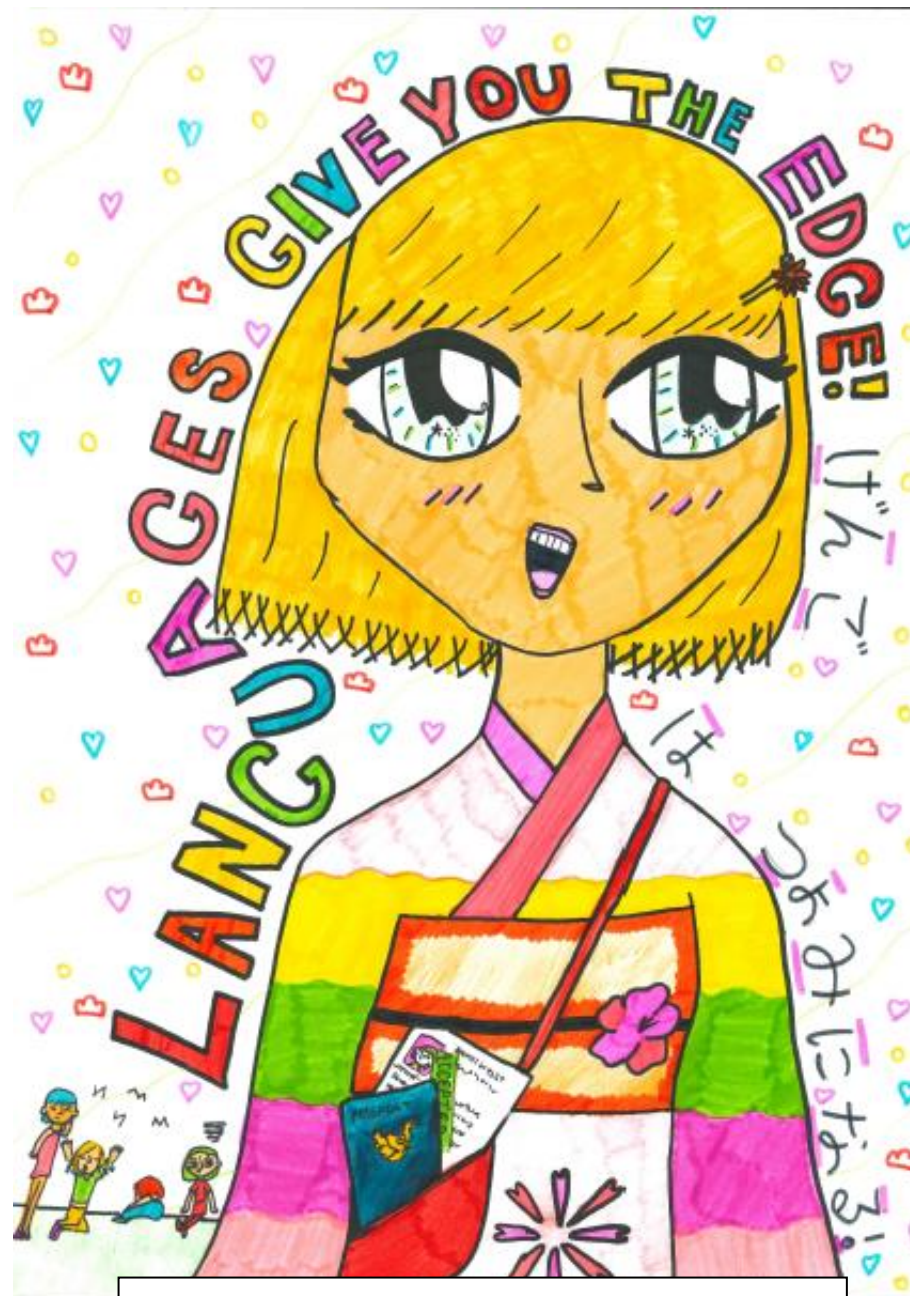
Category B: Dahlia Violet DUIGAN, Year 5, Japanese