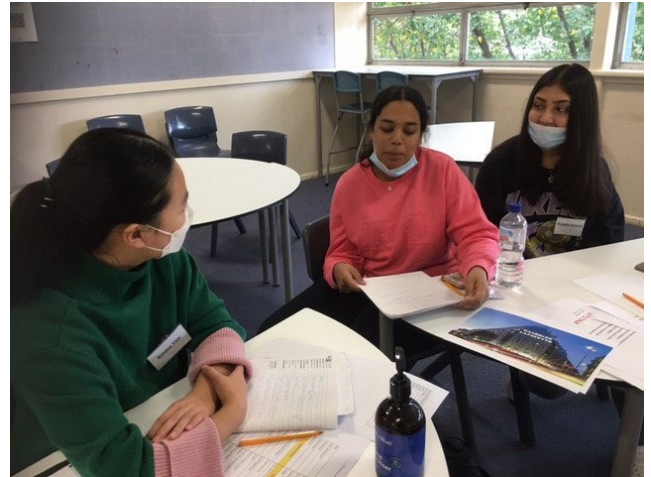
(Preparing to show a tourist through Paris)

interactive learning experiences in Chinese, French, German, Indonesian, Italian Japanese and Spanish.