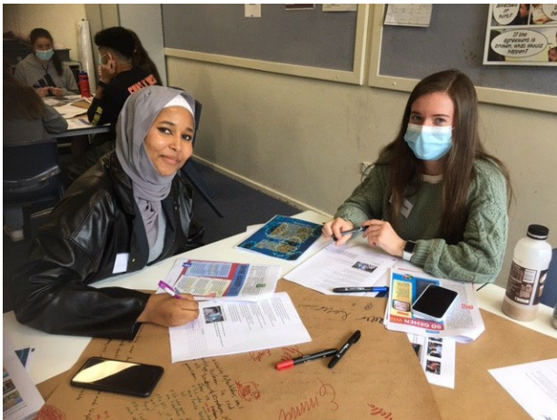
(Technology; Friend/Foe? Preparing for a debate in German)

During the April holidays, on Thursday 21st and Friday 22 nd , we once again ran "Let's Talk!" our state government funded program for secondary students of languages. This program was developed to support senior secondary language learners from across the state.