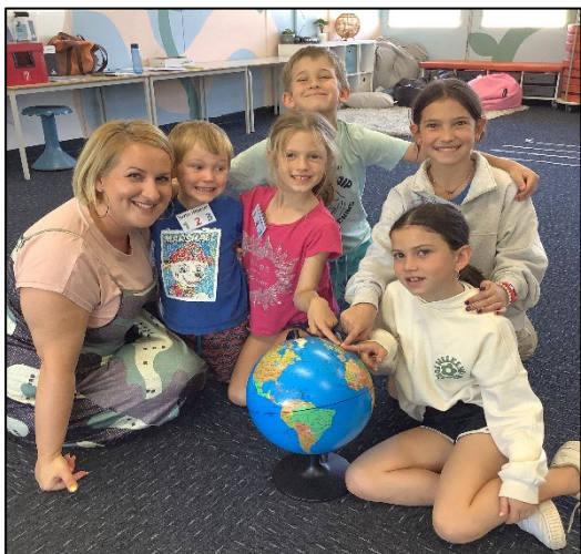
Students enjoying activities at the April Languages Alive! April program