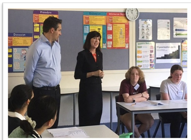
The Minister for Education, the Hon Blair Boyer, MP and the Deputy Premier, the Hon Susan Close, MP

Let's Talk! will also be offered during the next school holidays on Tuesday 11 th and Wednesday 12 th July from 10.00am-3.30pm at the School of Languages. For further info go to our website https://schooloflanguages.sa.edu.au/lets-talk-3/